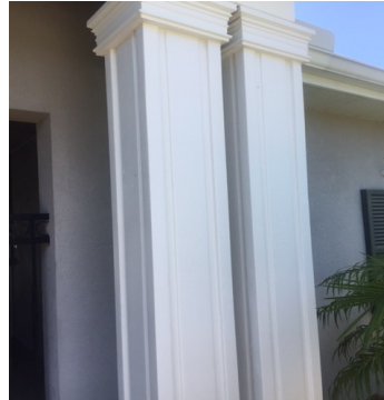
Newly painted columns at cabana.

do some much needed painting on portions of the pool cabana.