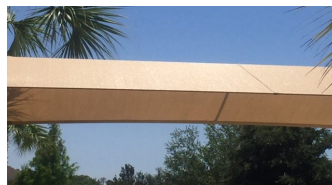
Pool shade after cleaning.

Last month the pool cabana and shade covers got a bit of a facelift. We hired Honel Property Maintenance to pressure wash everything and also