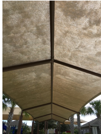
Pool shade before cleaning.

Last month the pool cabana and shade covers got a bit of a facelift. We hired Honel Property Maintenance to pressure wash everything and also