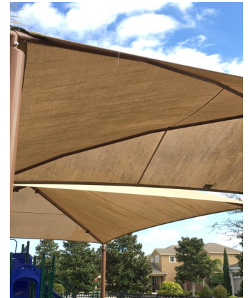
Shade before cleaning.