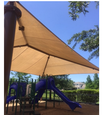
Shade after cleaning.