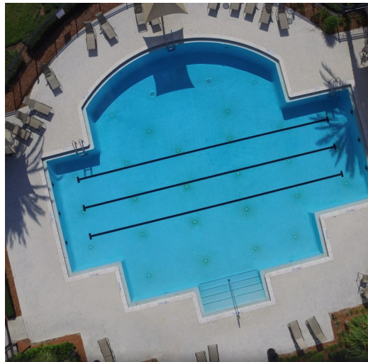
Pool before treatment showing circular rust stains.

If all goes well the stains will be completely gone soon and the pool will be beautiful and sparkling.