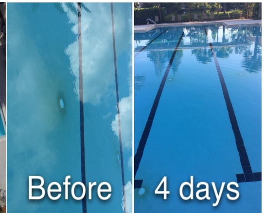
Side by side comparison before treatment and 4 days after treatment. Results take 3 weeks for full effect.