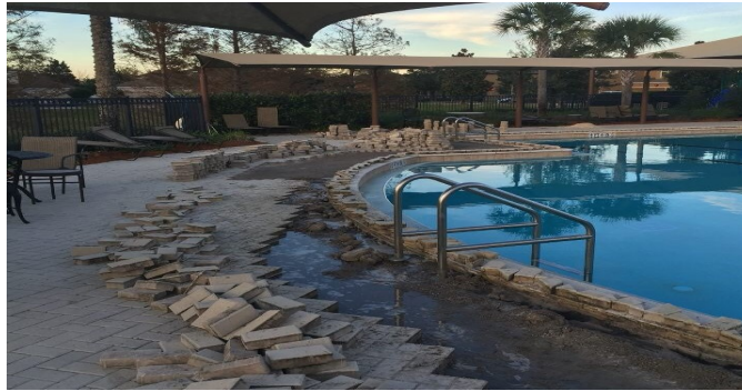
Pool deck while repairs were underway.

The community pool had to be closed twice since November for deck safety issues.